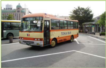
Typical Appearance of Tokai Bus

Get off here for Mishima City Office and walk for 5 minutes to South towards Route 1.